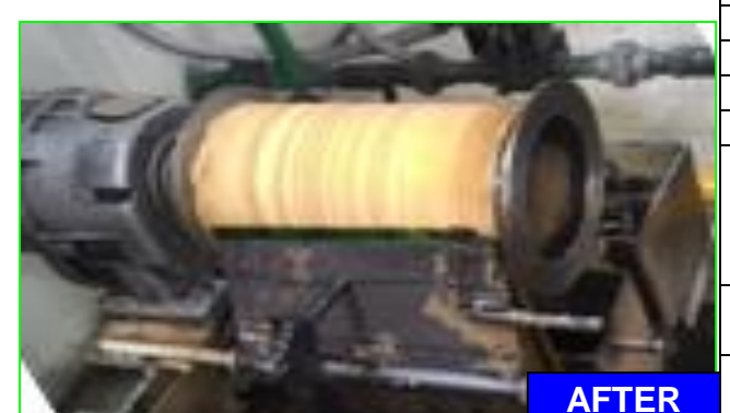
RESULT:-1. Increased the belt life

COUNTERMEASURE:- Provide a plastic wiper Between Ms wiper & Belt. So that Belt can not be damaged.